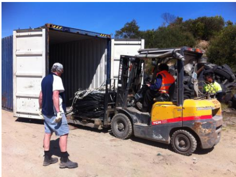
Loading the container

BIL this week helped the Lions Club to load a container of scrap metal and batteries bound for mainland Tasmania to be recycled. The waste material would otherwise end up in land fill.